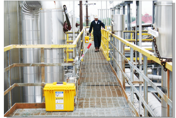
ATOM PTK unit out in the field

ATOM PTK is our very own design that uses a lightweight and portable case which can be carried easily within a job site. Employees and contractors can badge in/out by swiping their cards by the sides of the PTK, at which point the data is sent to the Toadfly servers through an Internet connection. From there, managers can access the ATOM web application and look at real-time punches, timesheets, attendance, reports, cost reports, man-hour reports, etc.